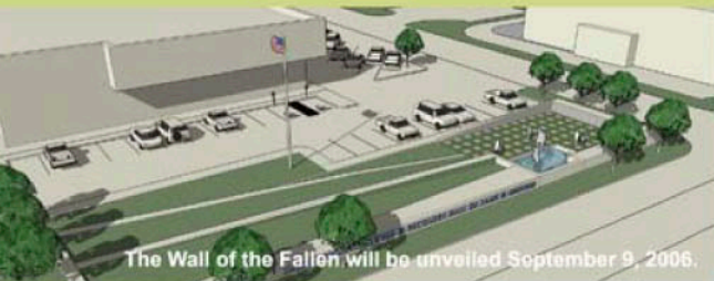
The Wall of the Fallen will be unveiled September 9, 2006.